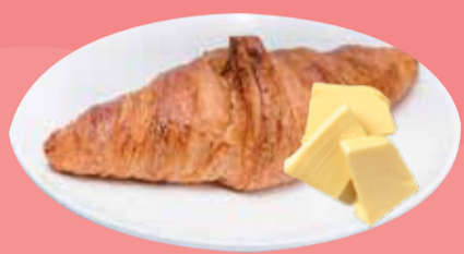
Butter Croissant (Served with portion butter) RM10.50