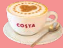
Cappuccino RM14.00 (M)/RM15.00 (L) (Hot / Iced)