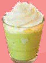
Matcha Vanilla Cream RM18.45 (M)/RM19.45 (L)