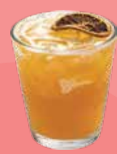
Lemon Peach RM14.00 (M)/RM15.00 (L)