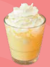
Coffee Cream RM16.40 (M)/RM17.40 (L)