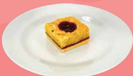
Raspberry Almond Traybake RM11.50