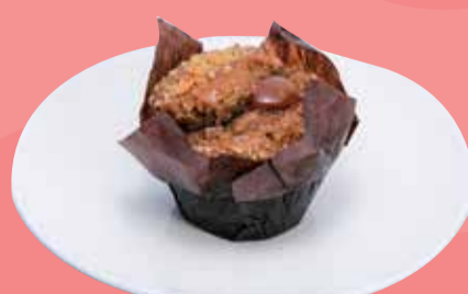
Coffee Butterscotch RM9.50