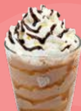
Chocolate Butterscotch RM18.50 (M)/RM19.50 (L)