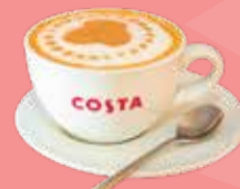
Vanilla Cinnamon Cappuccino RM17.50 (M)/RM18.50 (L) (Hot / Iced)