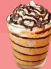
Double Chocolate Cream RM18.45 (M)/RM19.45 (L)