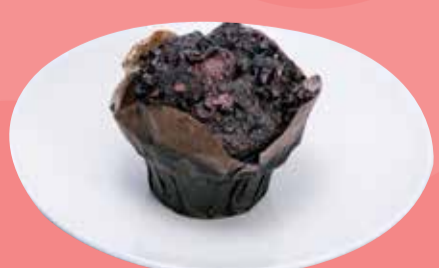
Chocolate Chip RM9.50