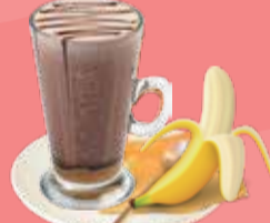
Chocolate Banana RM18.50 (M)/RM19.50 (L) (Hot / Iced)