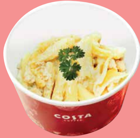
Costa Chicken Carbonara RM17.45