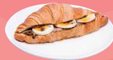
Tuna Mayo with Egg Croissant RM16.30