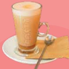
Salted Caramel Mocha RM16.40 (M)/RM17.40 (L) (Hot / Iced)