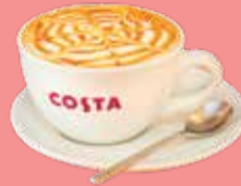
Butterscotch Cappuccino RM17.50 (M)/RM18.50 (L) (Hot / Iced)