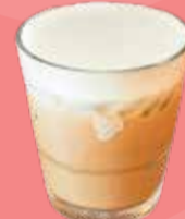
Iced Signature With Chilled Foam RM17.00 (M)/RM18.00 (L) (Hot / Iced)