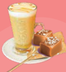
Salted Caramel RM14.40 (M)/RM16.40 (L) (Hot / Iced)