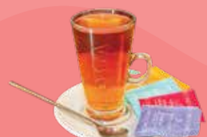
Brewed Tea RM13.25 (M)/RM14.25 (L) (Hot / Iced)