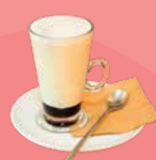
Gula Melaka Milk Tea RM16.00 (M)/RM17.00 (L) (Hot / Iced)

*Visual is for illustration purposes only. T&C Apply *Price includes SST