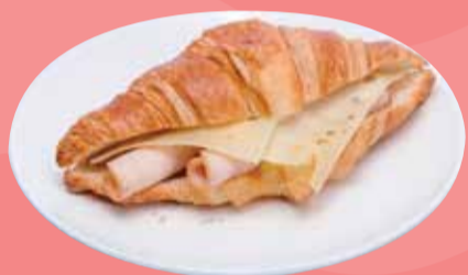
Turkey Breakfast Roll & Cheese Croissant RM17.40