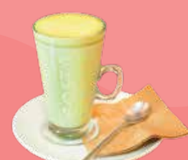
Matcha Milk Tea RM16.00 (M)/RM17.00 (L) (Hot / Iced)