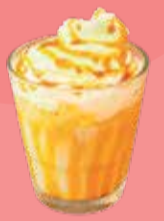
Salted Caramel Cream RM16.35 (M)/RM17.35 (L)