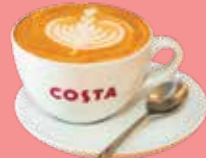
Flat white RM15.90 (M) (Hot / Iced)