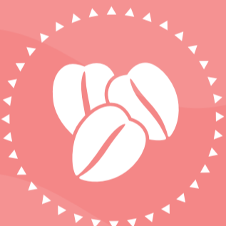
Sesame and Cream Cheese Bagel (Served with Cream Cheese) RM9.40