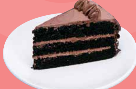
Chocolate Indulgence Cake RM13.70