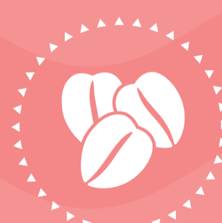
Coffee Baked Cheesecake RM14.80