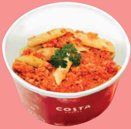
Costa Chicken Bolognese RM17.45