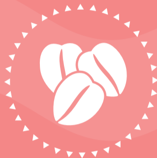
Raisin Scone (Served with portion butter&jam) RM11.55