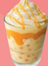
Bubbly Mango RM18.50 (M)/RM19.50 (L)