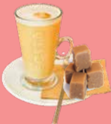
Butterscotch RM18.50 (M)/RM19.50 (L) (Hot / Iced)