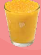
Mango Passion Cooler RM18.50 (M)/RM19.50 (L)