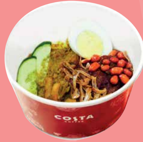
Nasi Lemak Chicken Curry RM17.45