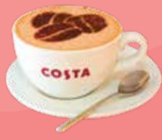
Roasted Hazelnut RM18.50 (M)/RM19.50 (L) (Hot / Iced)