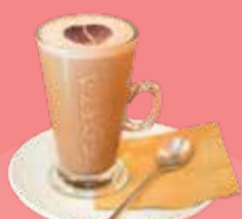
Hot Cinnamon Chocolate RM16.20 (M)/RM17.20 (L)