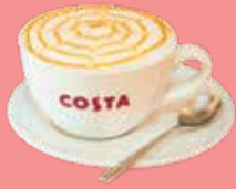
Salted Caramel Cappuccino RM17.50 (M)/RM18.50 (L) (Hot / Iced)