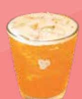
Iced Peach Tea RM14.45 (M)/RM15.45 (L)