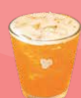
Iced Lemon Tea RM14.45 (M)/RM15.45 (L)