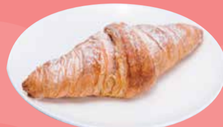
Hazelnut Chocolate Croissant RM12.10