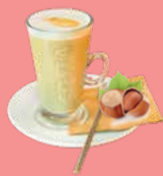
Hazelnut latte RM14.40 (M)/RM16.40 (L) (Hot / Iced)