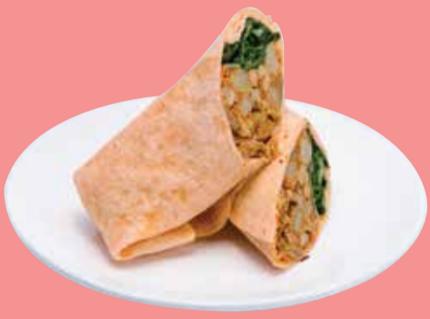
Chicken Rendang Wrap RM13.20