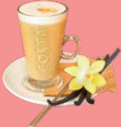
Vanilla Latte RM14.40 (M)/RM16.40 (L) (Hot / Iced)