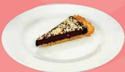
Coconut Fudge Tart (Flourless) RM16.90