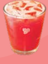
Strawberry Passionfruit RM18.50 (M)/RM19.50 (L)