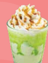
Pandan Gula Melaka RM18.45 (M)/RM19.45 (L)