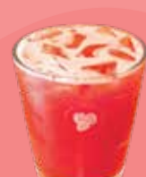
Iced Tea Strawberry RM14.45 (M)/RM15.45 (L)