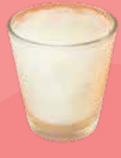
Lychee Lemonade RM18.50 (M)/RM19.50 (L)