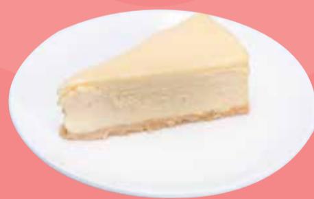
London Cheesecake RM13.70