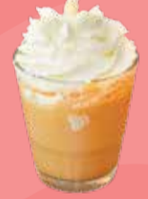
Mocha Cream RM16.40 (M)/RM17.40 (L)