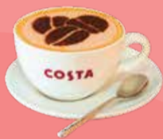
Mocha RM16.00 (M)/RM17.00 (L) (Hot / Iced)