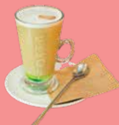
Pandan Gula Melaka RM18.50 (M)/RM19.50 (L) (Hot / Iced)