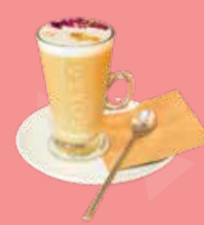
Vanilla Rose RM18.50 (M)/RM19.50 (L) (Hot / Iced)