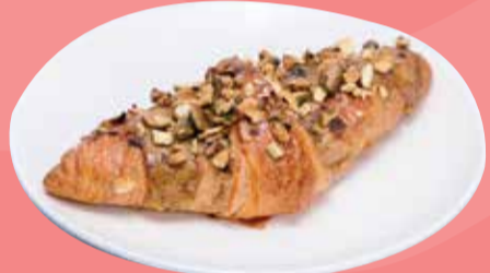
Pistachio Croissant RM17.40