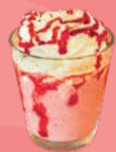
Strawberry Cream RM16.35 (M)/RM17.35 (L)