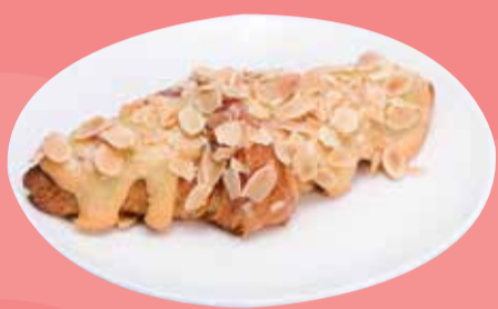
Almond Croissant RM12.10