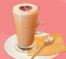
Hot Signature Chocolate RM14.00 (M)/RM15.00 (L)