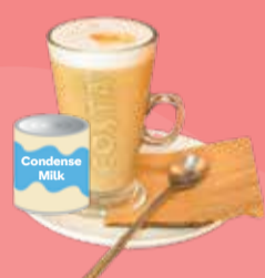
Costa Kopi RM18.50 (M)/RM19.50 (L) (Hot / Iced)