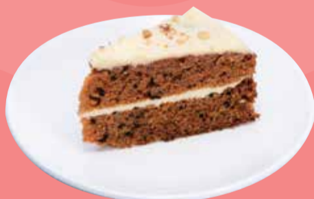
Carrot Cake RM11.60