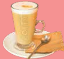
Latte RM14.00 (M)/RM15.00 (L) (Hot / Iced)